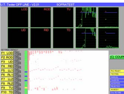
Full body lamination chart