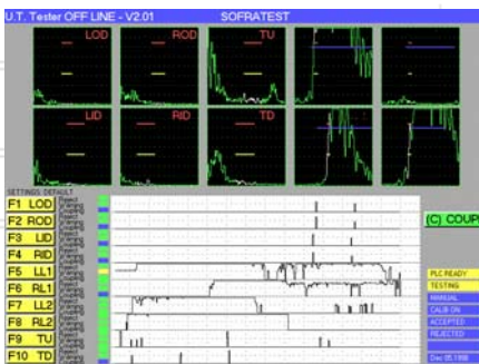
Ends + Weld seam + edge's lamination envelope in real time